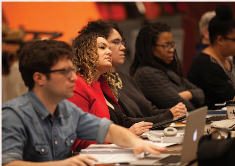
▼ Part of the creative team for the Treemonisha production.