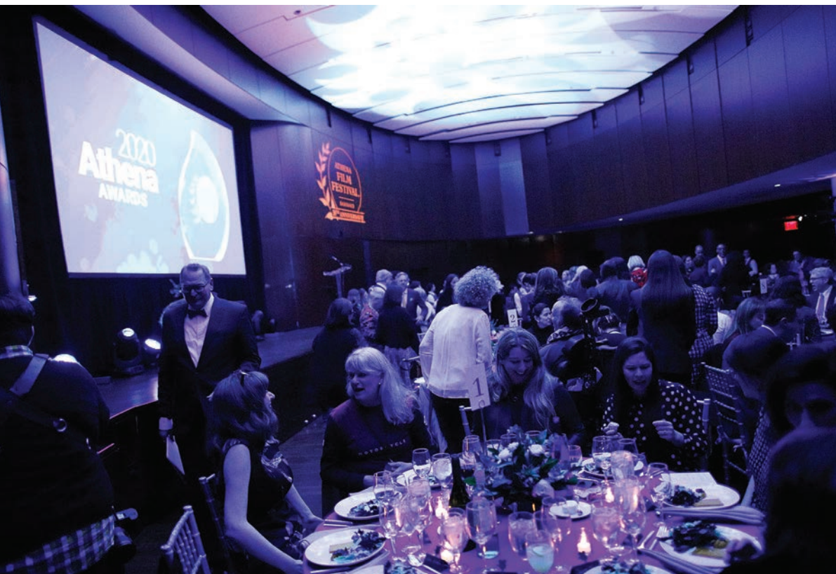
▼ The 2020 Athena Film Festival awards ceremony in New York City.

KOLBERT: Frozen was a huge breakthrough in terms of animated films. Not only was it a great story focused on women characters, it was also a blockbuster. The fact that female characters were leading the film—and that it also made a lot of money—was really key in opening doors for women in film.