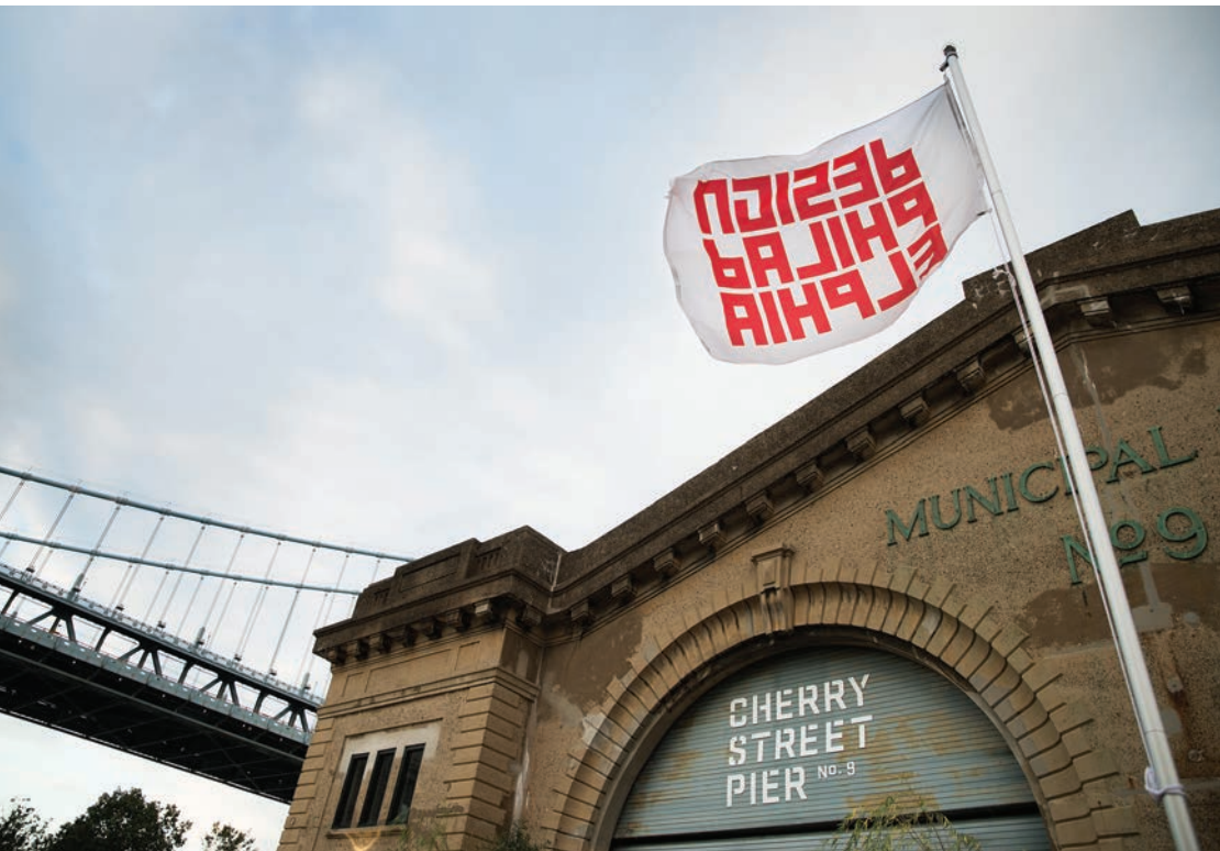
▲ Cherry Street Pier, the public hub of DesignPhiladelphia.

design is [about asking] how are you creating spaces that are accessible and open so that everybody uses them.”