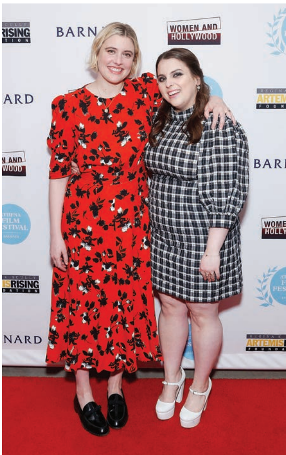
◀ Greta Gerwig and Beanie Feldstein attend the 2020 Athena Film Festival awards ceremony.