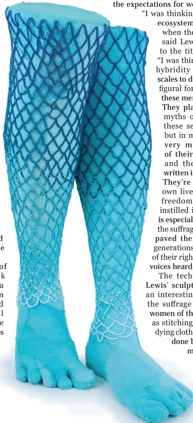
► Tidal Bather VII (2018). Plaster gauze cast from mold of artist’s body, wood, mesh, fabric, glass beads, felt, thread.

The techniques used in Lewis’ sculptures also share an interesting connection to the suffrage movement and women of the past. Arts such as stitching, beadwork, and dying cloth were historically done by women across many diverse cultures. For Lewis,