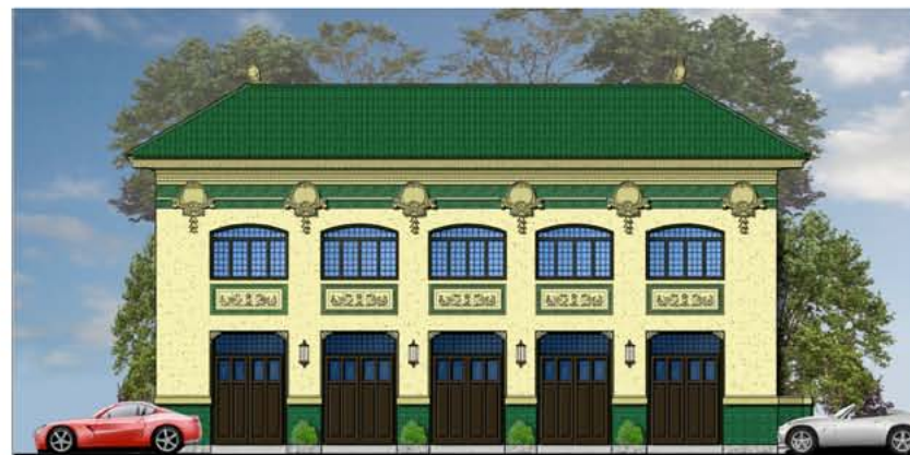
The restored front elevation of the Central Fire Station.

The new home for the Shreveport Regional Arts Council, now Central ArtStation, devotes 65% of its space to public use for community art and arts programming, including a 4,000 s.f. multi-purpose "Engine Room" performance/exhibition space, an emerging artist gallery, and artists' business center. This giant step will plant the region's most dynamic Arts "Engine" in the center of SHREVEPORT COMMON, with non-stop activities, conferences, artist entrepreneurial opportunities, performances and programming that will energize the community's core, attracting artists, citizens, and visitors. Central ArtStation is now a reality--funded, under construction, and opening Fall 2012.