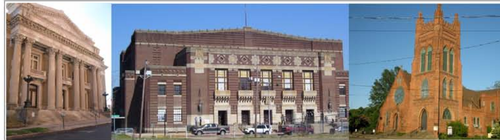
Some of Shreveport's most valuable architectural landmarks are in Shreveport Common

A new City bond issue will provide for restoration of Municipal Auditorium and Oakland Cemetery, the two largest landmarks in the district, and private renovations have begun on the three other important buildings, the Scottish Rite Cathedral, Holy Cross Church and Calanthean Temple. Within the first year since the Visioning process, six neglected or abandoned properties have been purchased for redevelopment and four stakeholders are upgrading their properties.