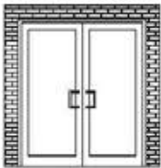
6'-0" x 7'-0" Door

New Glazed Doors in Metal Frames @ Masonry Openings with "toothed-in" brick