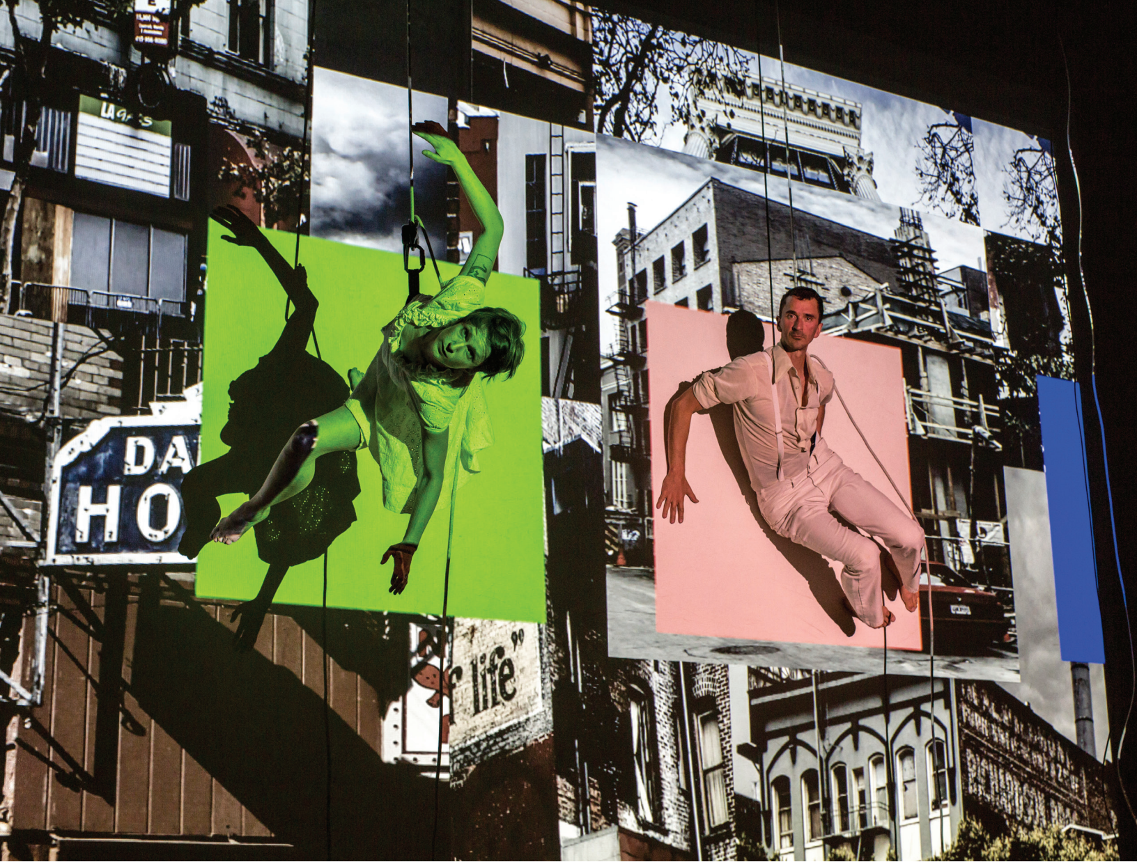
▲ One of Bandaloop's #PublicCanvas performances in San Francisco, California.

A s people gathered below the building and looked up, a dancer sprang out from one of the windows. Tethered by mountaineering ropes, she completed a graceful and joyous arc before landing feet first on the side of the building, using it as a stage to catapult herself again into space. Spectators' faces showed gaping wonder, smile-busting delight, and a touch of terror. The dancer was soon joined by others, and together they created stunning currents of movement that gave a whole new identity to a public building. This is the work of the vertical dance company Bandaloop.