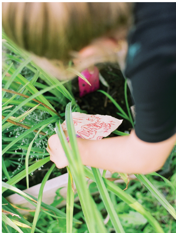
► A READ | SEED | WRITE participant planting seed paper at the Seneca Babcock Community Garden.

through the plants grown there, as well as [through] sculptures and neighborhood activities." Seneca Babcock Community Garden is primarily a community center with various programming for youth and seniors. International School #45 is exactly what it sounds like: an elementary school that serves diverse immigrant and refugee populations on the city's West Side.