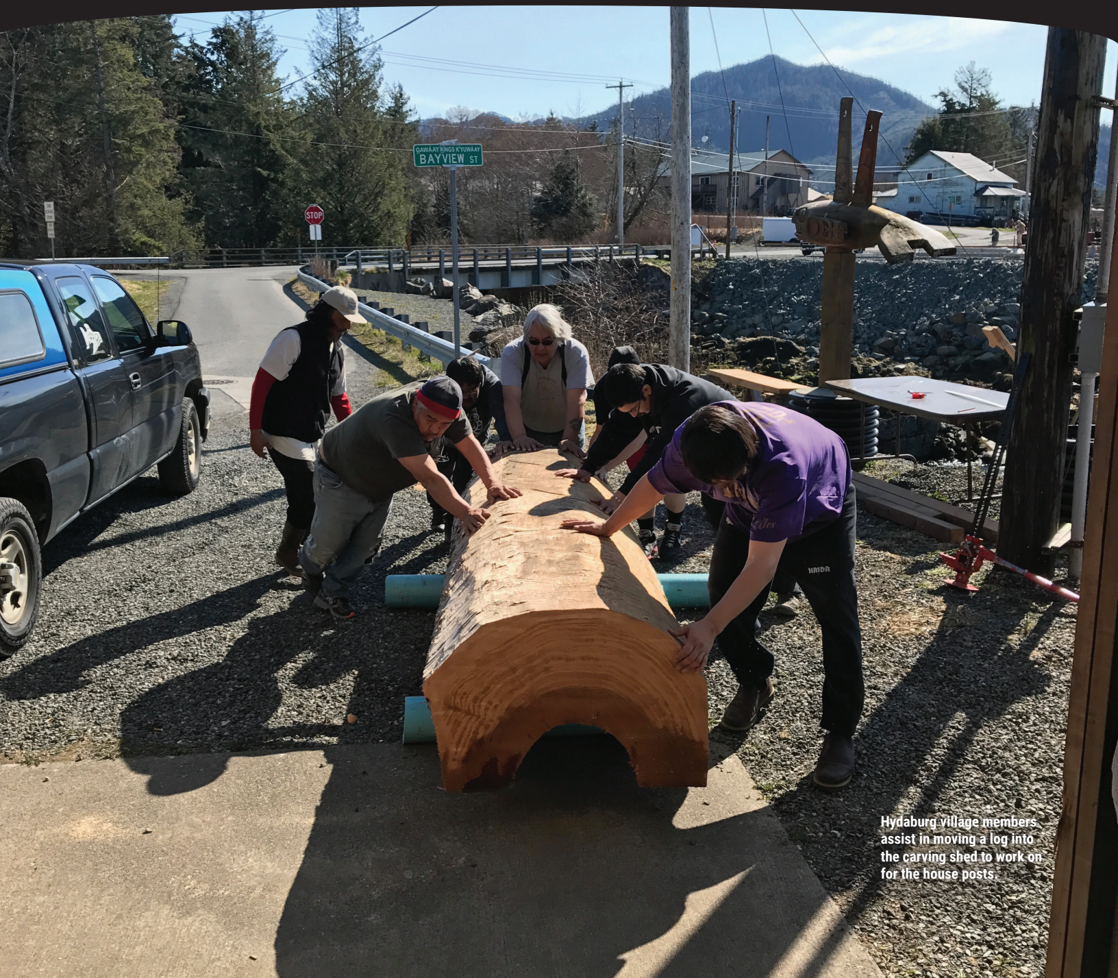
Hydaburg village members assist in moving a log into the carving shed to work on for the house posts.