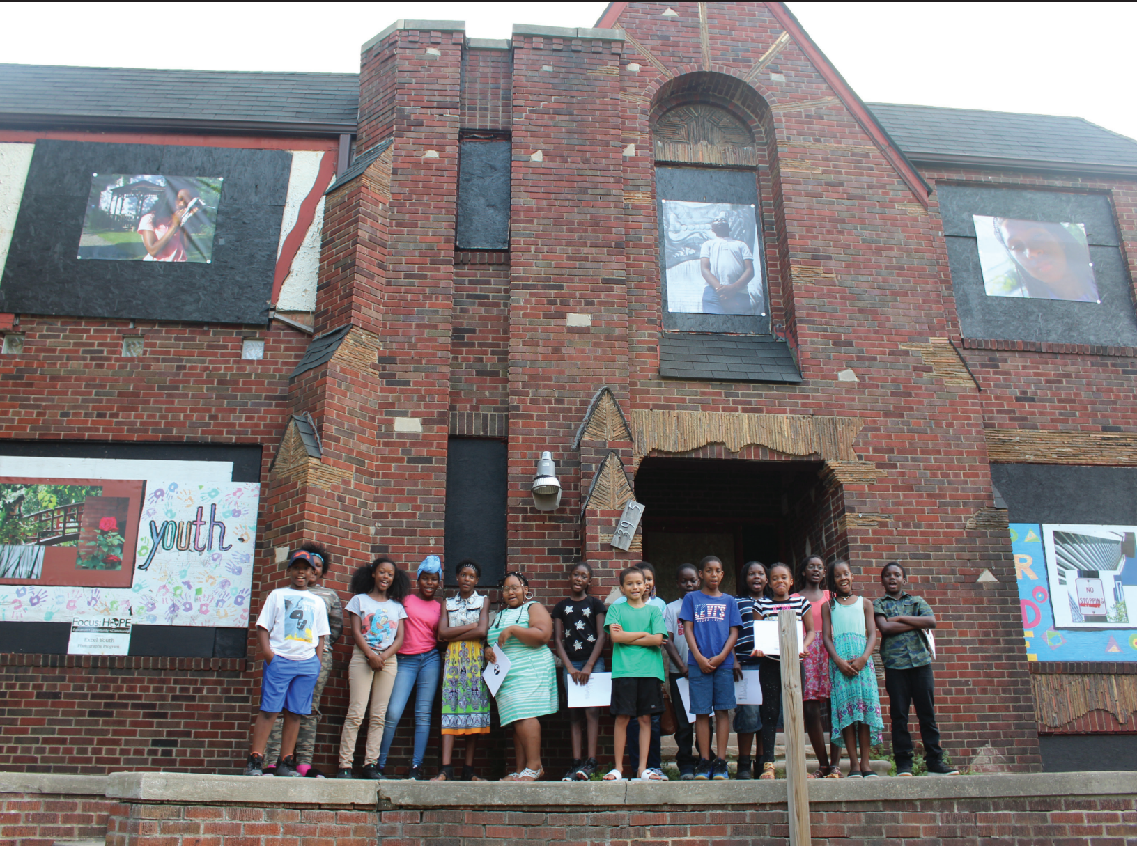
▼ Focus: HOPE students proudly show off their photography on a vacant neighborhood building in Detroit, Michigan.