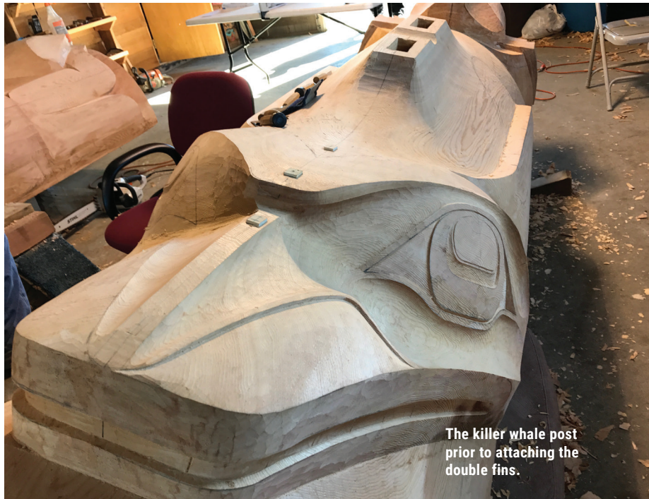
The killer whale post prior to attaching the double fins.