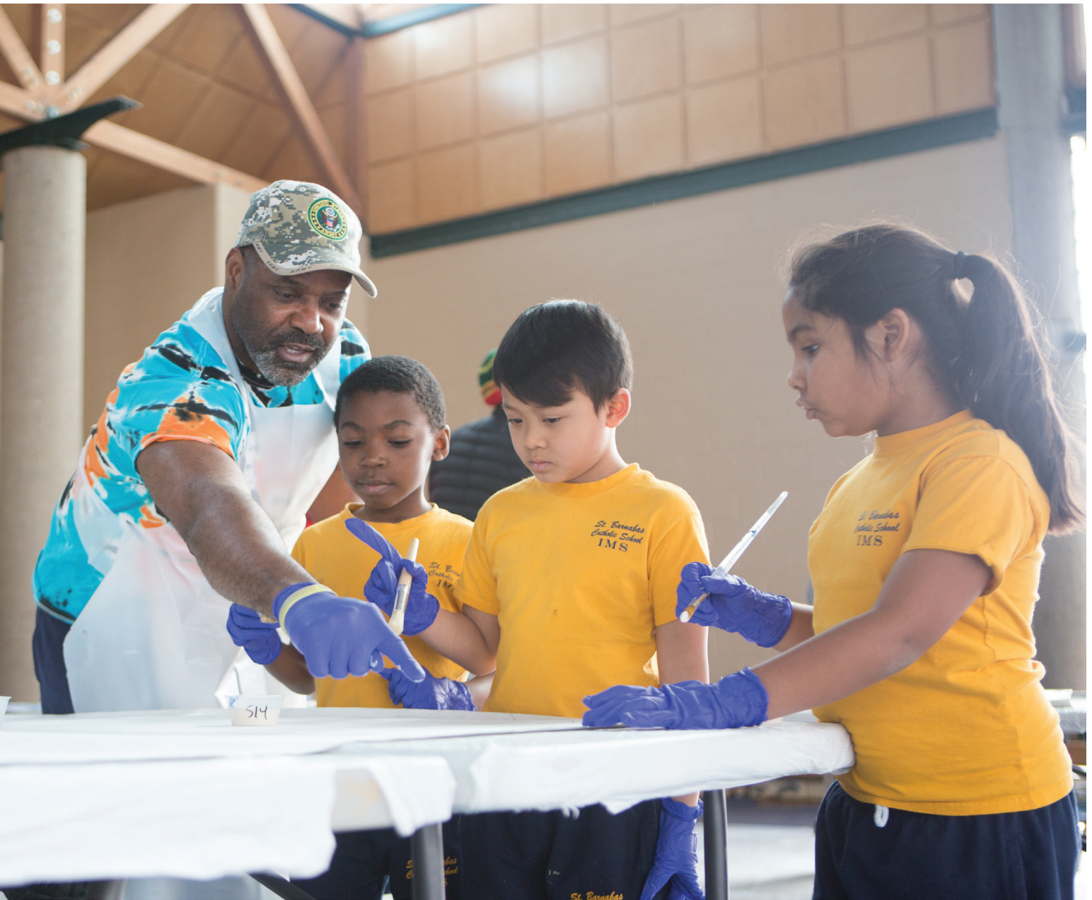
▲ Military veterans work with youth to paint the city's Corporal Michael J. Crescenz VA Medical Center.