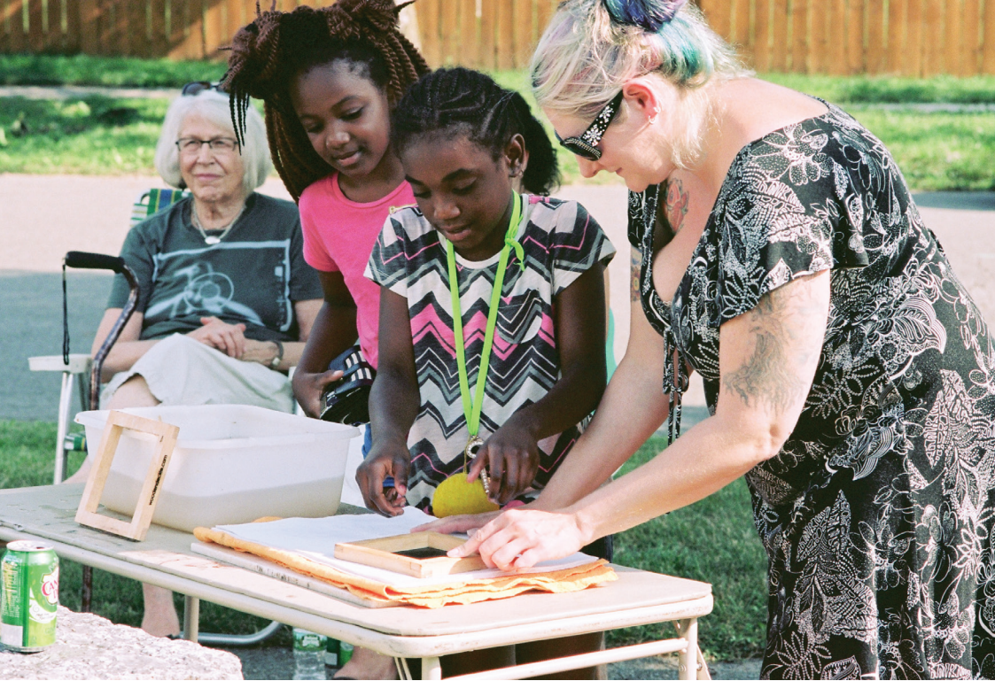
▲ READ | SEED | WRITE participants making seed paper.

Because each garden is its own microcosm that serves communities with different demographics, programming catered to the needs of each garden community. The Black Rock Heritage Garden, for example, is the oldest community garden in the city of Buffalo, and the site of many historic battles from the War of 1812. Melissa Fratello, Grassroots Gardens' former executive director who worked on READ | SEED | WRITE, called this garden the organization's only "binational peace garden, and one that celebrates history