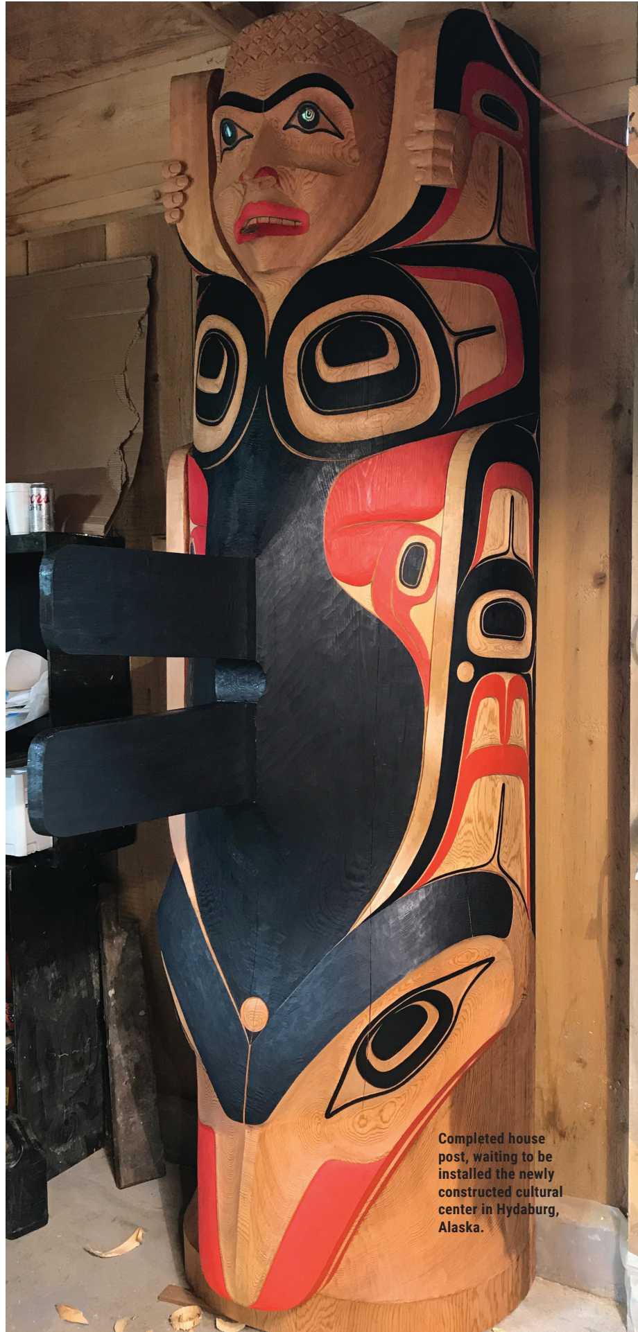
Completed house post, waiting to be installed the newly constructed cultural center in Hydaburg, Alaska.