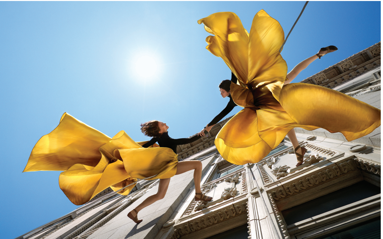
▲ Bandaloop performers on the Oakland City Hall in California.