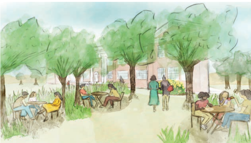
▲ Map of Fort Apache Historic Park and rendering of proposed gathering space.