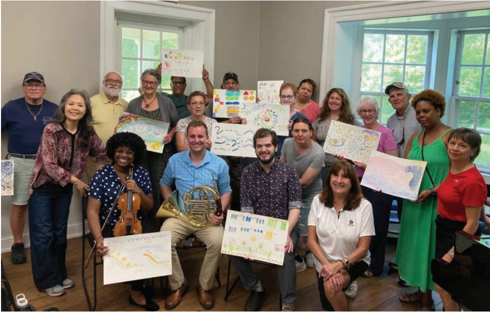
▲ Group photo of At Ease participants with their final artworks of the 2023 Water(color) for the Soul Music Composition Residency with Black Moon Trio.