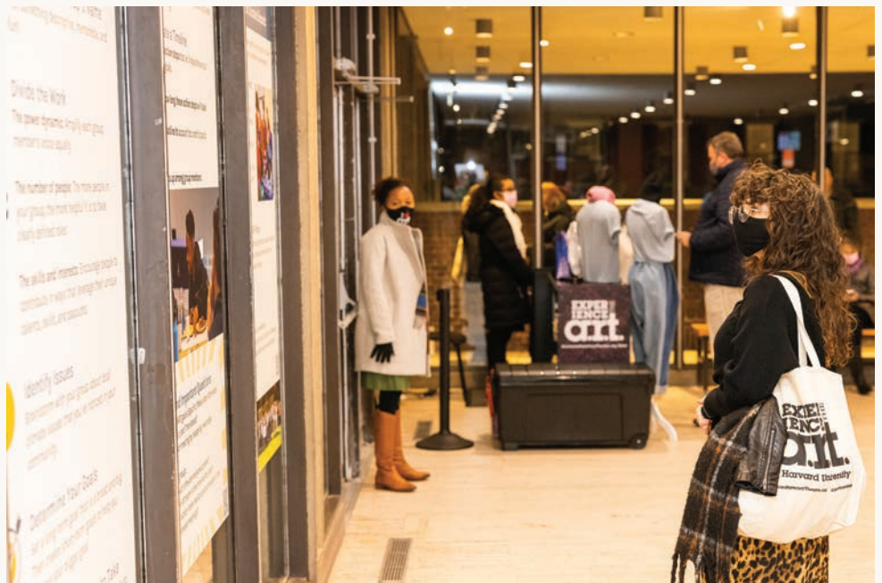
▼ Audience at pre-show for American Repertory Theater's production of WILD: A Musical Becoming in 2021.

While theaters pay attention to air quality, with a focus on thermal comfort, Allen believes it's time to broaden the perspective, such as, "How do we improve air quality beyond making sure it's comfortable from a temperature perspective? Then we can think about water